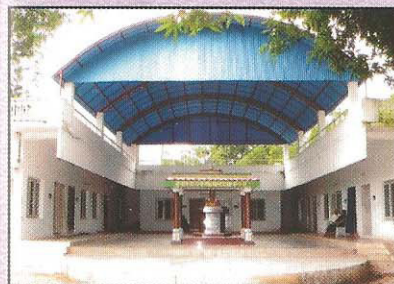
Senior Citizens Ashramam