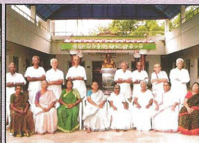
Residents of Ashramam